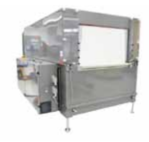
The figure may show optional equipment, ordered separately

The Universal HV series from Kallfass has been specially developed for the production of polyethylene film transport packaging that is closed on all sides. Using refined HV technology, this can be accomplished without additional sealing tools and in combination with Kallfass bundle packaging machines. An integrated high-intensity blowing device in the shrinking zone of the tunnel ensures controlled overlap and bonding of the lateral film overhang. Wear-free, contactless temperature control and highly effective thermal insulation with a double insulation hood reduce energy consumption. This helps to save natural resources.