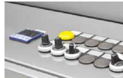
Easily adjustable shift register for adaptation to the product outline.