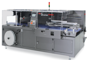
The figure may show optional equipment, ordered separately

The Universa 800 Servo is a hybrid that closes the gap between intermittent motion and continuous motion side sealers. It is the first time that a single machine can offer combined advantages from both machine types. Perfect packaging results for highest requirements. High impact retail packaging for industrial products and high value products in large format.