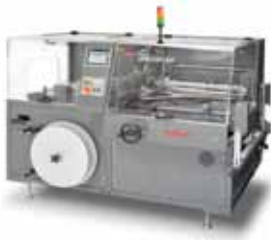
The figure may show optional equipment, ordered separately

The name of this universal film packaging machine represents both its underlying concept and its objective. Manufacturing companies with a broad product range and industrial services as well as contract packaging companies benefit greatly from the efficient production processes. Precise compliance of the bag length ensures a high standard of quality for the film packaging.