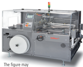
The figure may show optional equipment, ordered separately

Manufacturing companies with a broad product range and industrial services as well as contract packaging companies benefit greatly from the efficient production processes. Precise compliance of the bag length ensures a high standard of quality for the film packaging.