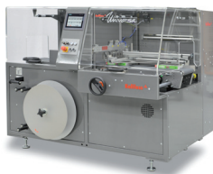
The figure may show optional equipment, ordered separately

The smallest member in the Universa family is characterized by its high performance and small footprint. The packaging system with the smallest footprint in the Kallfass range of products, based on the proven and robust Universa series, it produces film packaging in high quality, just like its bigger „family members“. Your benefit: Small, powerful, efficient!