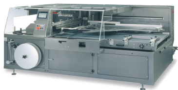
The figure may show optional equipment, ordered separately

Manufacturing companies with a broad product range and industrial services as well as contract packaging companies benefit greatly from the efficient production processes. Precise compliance of the bag length ensures a high standard of quality for the film packaging of huge products.