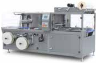
The figure may show optional equipment, ordered separately

The SERVO PACKER 500 is „Kallfass’s fast hybrid“, with motion controlled travelling cross seal bar system, which allows extremely tight packaging, without shrinking. Due to the film transport on both sides, real square plastic bags are generated. These are requirements for accurately fitting seams for cubic products. User-friendliness is guaranteed by the 7” HM-Interface - Easy Touch - with its easy and intuitive operation.