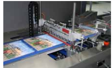
Servo Packer 500. The fast hybrid combines the benefits of a universal side sealer and a film packaging system, making extremely tight packaging possible.