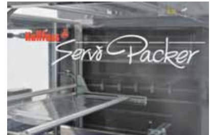
The Servo Packer 1000 T with the intermittent operating principle in customary Kallfass quality