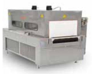
The figure may show optional equipment, ordered seperately

all and the first state of the state of the