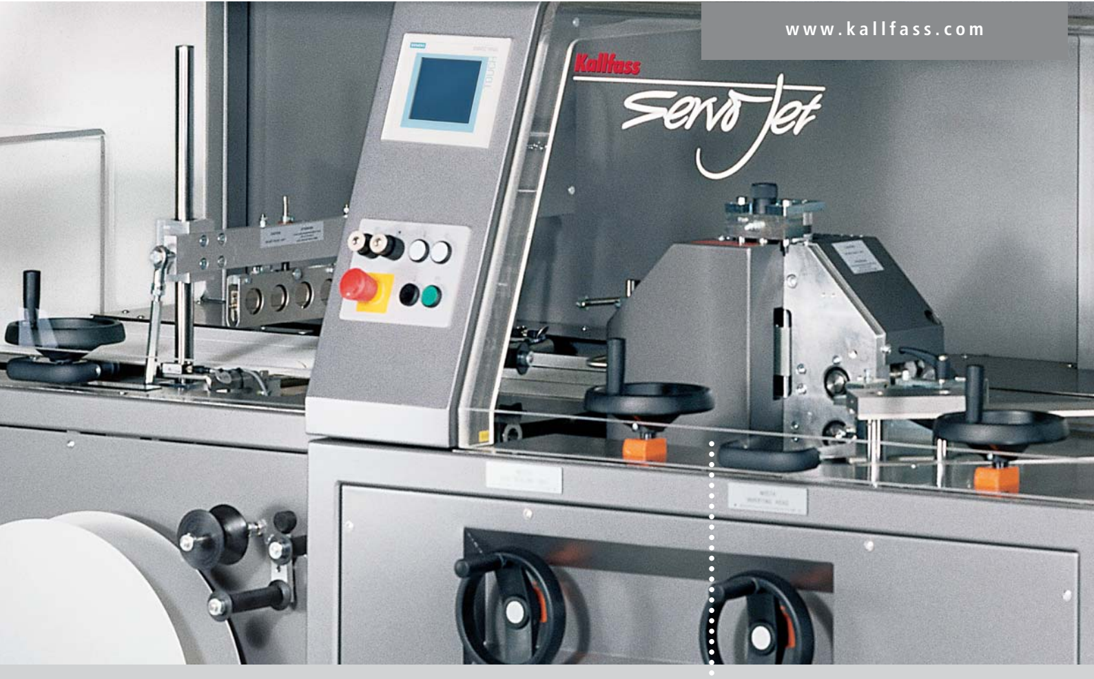
Fully-automatic high-performance side sealer with continuous motion sealing system