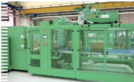
SUPER WRAP 1600 EM - sleevewrapping in film