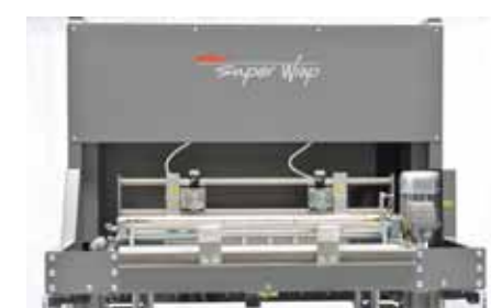
Super Wrap 500: Especially designed for sleevewrapping in PE-film.