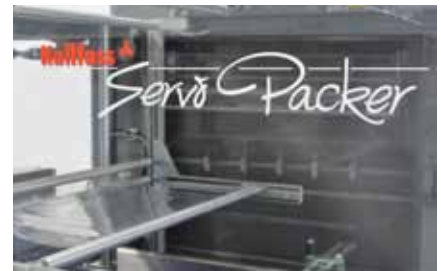
The Servo Packer 500 T with the intermittent operating principle in customary Kallfass quality