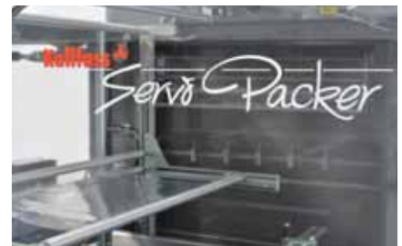
The Servo Packer 1000 T with the intermittent operating principle in customary Kallfass quality