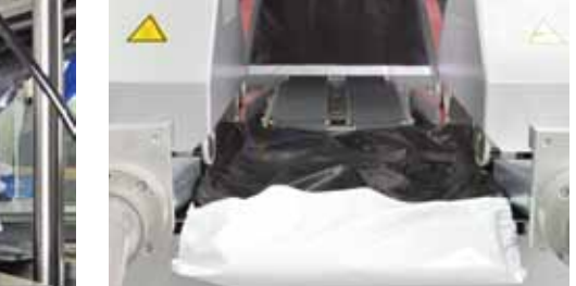
The Logi Wrap 500: space saving, flexible and powerful